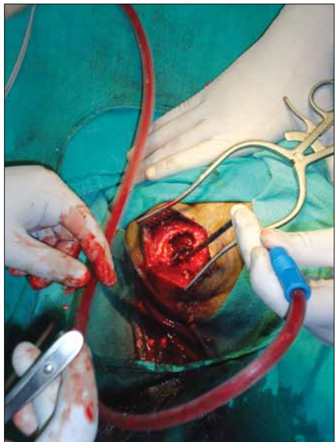
Figure 8: Full exposure of scissors heads after circumferential craniectomy.