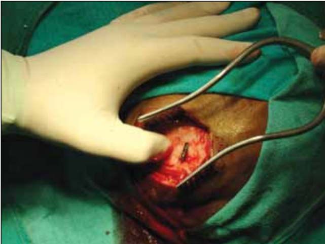
Figure 5: Entry point showing metallic foreign body after skin incision.

removed (Figure 9) cautiously to prevent any vascular insult. Mud and chipped of pieces of rust were also removed. Local cleaning was done with saline and hydrogen peroxide. Local contused brain was decompressed. Duroplasty was done and skin was closed.