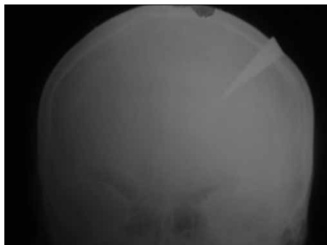
Figure 1: Skull X- ray showing foreign body in AP view.