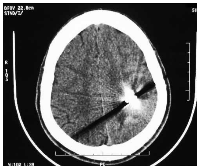
Figure 3: CT scan showing foreign body in brain matter.