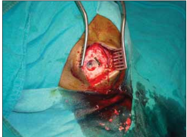
Figure 6: Burr hole made adjacent to entry site.