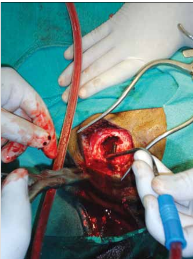
Figure 7: Craniectomy showing underlying Hematoma.