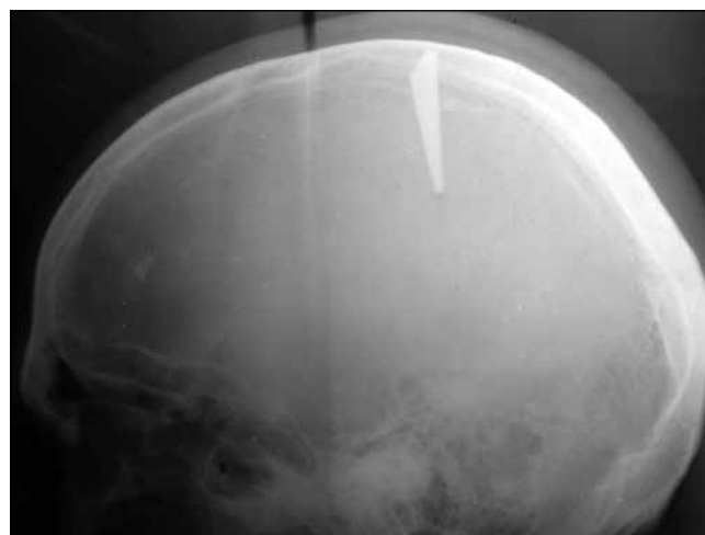
Figure 2: Skull X- ray showing foreign body in Lateral view.

Surgical Procedure: The patient was taken up for surgery. A local incision was given at the site of stab. Upon retraction