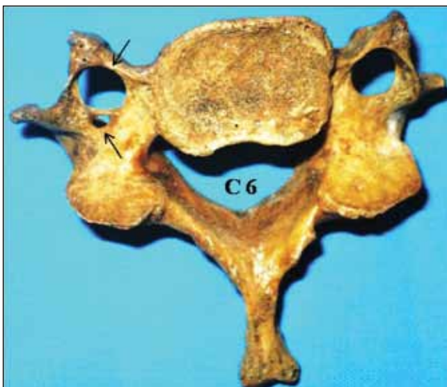
Figure 2: Photograph of C6 cervical spine (inferior view) showing the unilateral double foramina transversaria (n=5, 1.4%).

the vertebral artery runs along the transverse process and not through the foramen transversarium. This is very common in the lower cervical vertebrae. Instead of entering to the sixth foramen transversarium, the artery may start to enter the foramen at higher levels. The greatest variability in foramen transversarium is found in the seventh cervical spine (14).