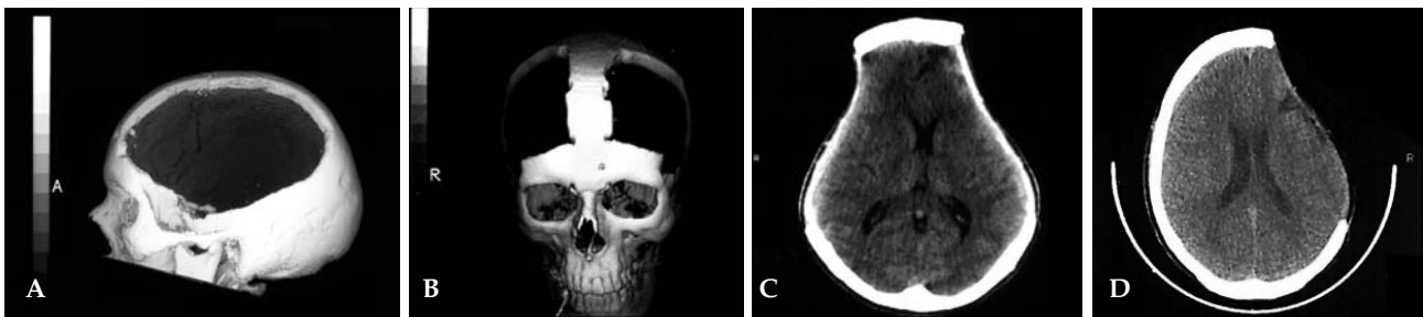
Figure 1: A) Representative neuroradiological studies obtained in patients with STBI. Craniectomy limits for unilateral DC; 3D CT appearance. B) Representative neuroradiological studies obtained in patients with STBI. 3D CT showing craniectomy limits for bilateral DC. C) Representative neuroradiological studies obtained in patients with STBI. CT showing bilateral DC on postoperative 5 months. D) Representative neuroradiological studies obtained in patients with STBI. CT showing unilateral DC on postoperative 4 months.

Descriptive statistics including mean, standard deviation and range were calculated for continuous parameters. Comparisons between groups were analyzed using Chi square test, Fisher's exact test and Paired-Samples t-test. Differences were considered significant when p < 0.05 . Data analysis