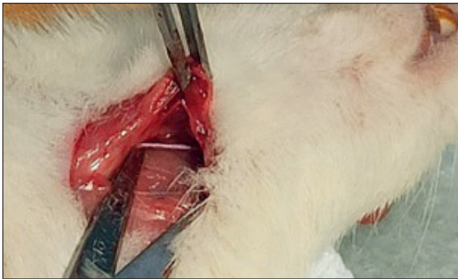
Figure 1: Surgical procedure of ischemia/reperfusion model. The study animals were placed in the supine position. A cervical median line incision of approximately 3 cm was made to provide middle cerebral artery ischemia and reperfusion. The common carotid artery was exposed by advancing with superficial microdissection.

SD: Standard deviation, pg/ml: Picograms/millilitre, I/R: Ischemia/reperfusion. One-way ANOVA tests were used; *: p < 0.05 .