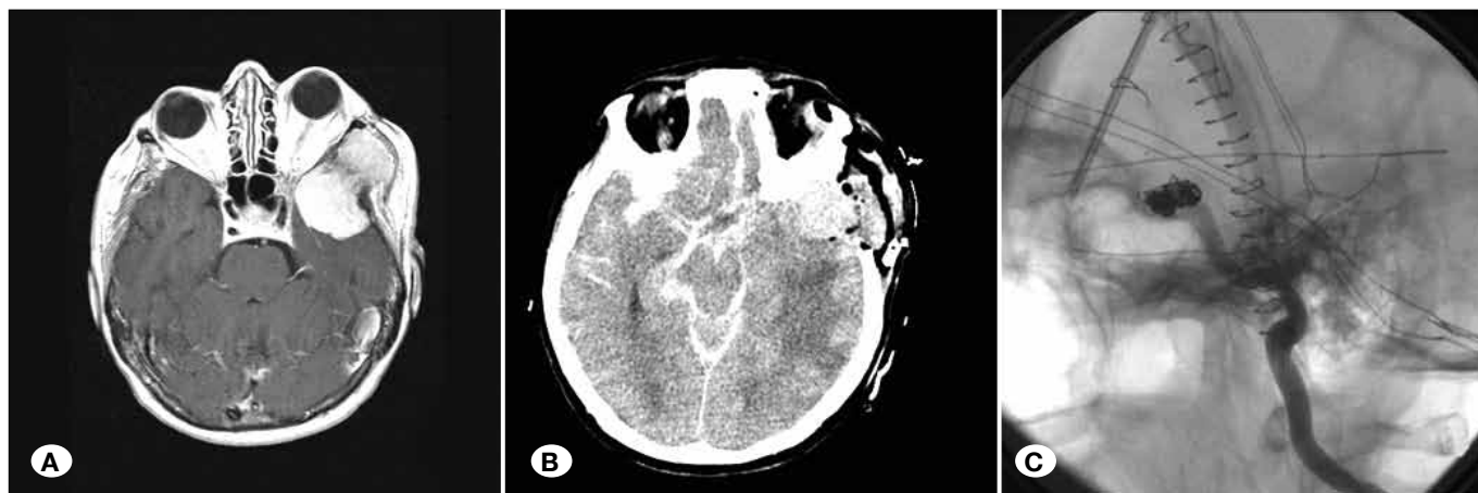
Figure 2: A) Preoperative magnetic resonance axial post-gadolinium T1-weighted sequence showing a left temporal mass. B) CT scan revealing a subarachnoid haemorrhage after craniectomy for tumor removal. C) Angiography after of paraclinoid pseudoaneurysm coiling.