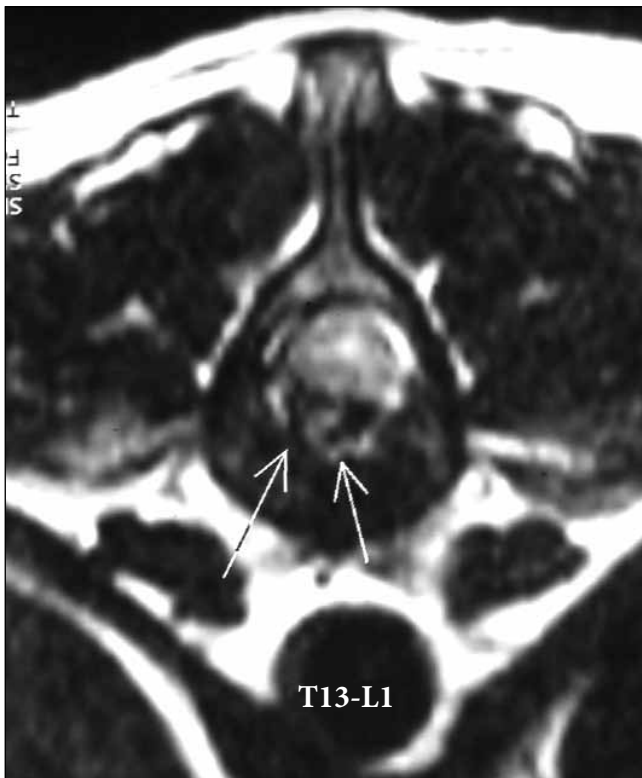
Figure 2: Axial T2 W image of the T13-L1 disk extrusion.

hemilaminectomy defect. All cases had hyperintense lesions in T2 w images in the spinal cord.