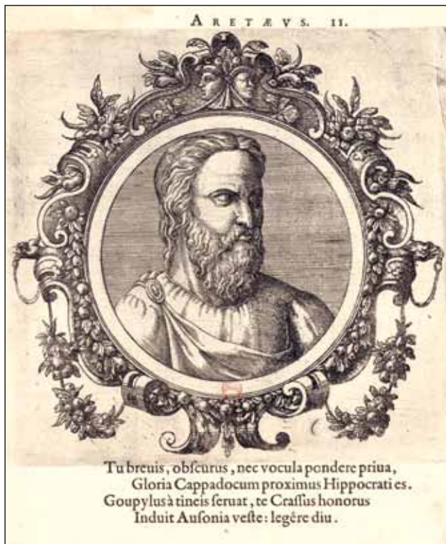
Figure 2: Engraved portrait of Aretaeus by Ioannes Sambucus (1574).

Its cause is of a cold and humid nature, as in dropsy. The nature of the disease, then, is chronic, and it takes a long period to form; but the patient is short-lived, if the constitution of the disease be completely established; for the melting is rapid, the death speedy. Moreover, life is disgusting and painful; thirst, unquenchable; excessive drinking, which, however, is disproportionate to the large quantity of urine, for more urine is passed; and one cannot stop them either from drinking or making water."