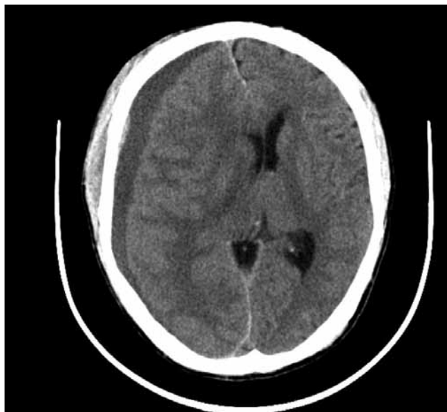
Figure 1: Computed tomographic scan of head reveals a right chronic subdural hematoma with midline shift to the left side.

the JP drain was removed smoothly. However, 5 days later, the patient had a sudden change in consciousness. On examination, the Glasgow coma scale (GCS) score was 5. Both pupils were dilated (right, 7 mm; left, 5 mm) and nonreactive to light. There was no external evidence of trauma to the head. Emergent brain CT scans revealed an acute SDH along the right cerebral convexity which caused uncal herniation