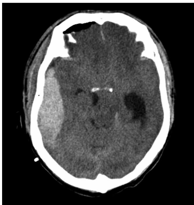
Figure 2: Computed tomographic examination of head shows high-density lesions on the right side consistent with an acute subdural hemorrhage: there is considerable midline displacement and uncal herniation.

with upper brainstem compression (Figure 2). Subsequently, a large acute SDH was evacuated through a right frontoparietal craniectomy. The skull bone and underlying dura mater were excised for histological examination. After the operation, slow neurological recovery was noted; however, left hemiplegia persisted. Three days later, severe gastrointestinal hemorrhage flared up. Upper gastrointestinal endoscopy was performed and it revealed two huge ulcerative masses with multiple bleeding sites. Microscopically, the sections showed a picture of some solid tumor cell nests with focally glandular differentiation infiltrated in bony and dural fragments (Figure 3 A,B). Histologically, metastasis of adenocarcinoma was detected in the dura mater and skull, which was quite similar to the gastric endoscopic biopsy specimens. The