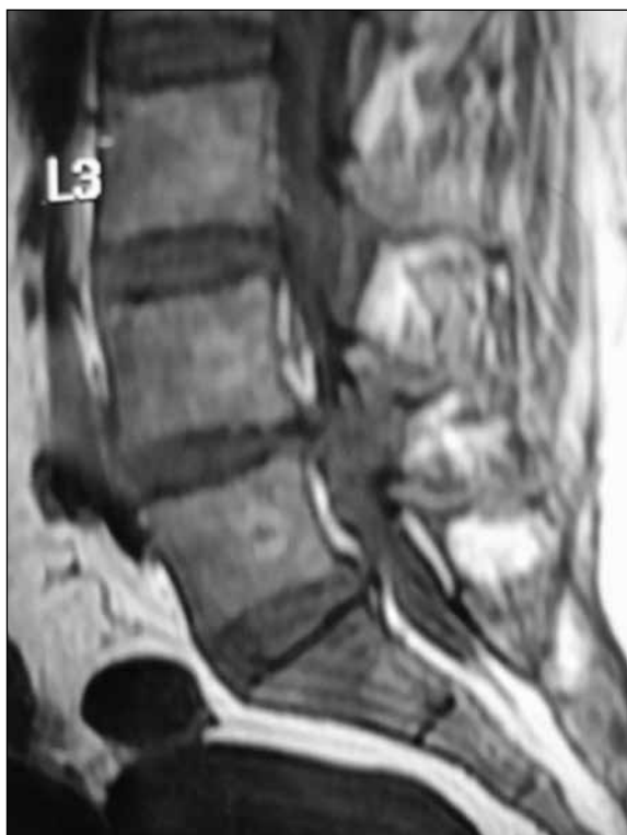
Figure 2: T1 sagittal MRI image showing disc herniation at L4-L5 level.