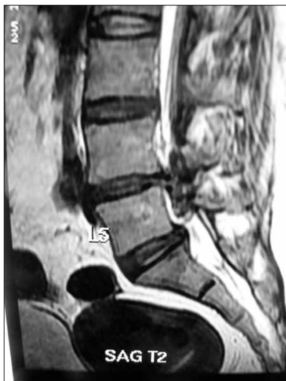
Figure 1: T2 sagittal MRI image showing disc herniation at L4-L5 level.

disc herniation. Approximately 123 cases of IDH have been reported since 1942 (3). The majority of them occurred at the L4-L5 levels and only 12 cases occurred at L5-S1. In all, 5% are found in the thoracic region, 3% in the cervical region and 92% in the lumbar region (3,4). The site most frequently affected is L4-5 (55%), followed by L3-4 (16%) and L5-S1 (10%) (1). Rarely,