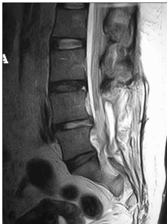
Figure 4: Post operative T2 Sagittal image of the patient.