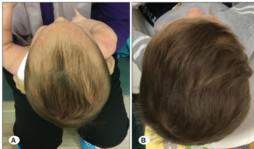
Figure 2: A) A photographic image of a patient with metopic synostosis before treatment. B) Photographic image of the patient with metopic synostosis at the end of treatment (One year later).

* p \leq 0.05 : statistically significant.