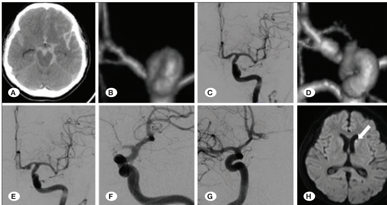
Figure 2: Endovascular trapping in Case 2. A) Initial CT reveals a diffuse SAH. B, C) Initial CT angiography and Anteroposterior view of the left ICAG show no significant abnormal vascular lesions. D) CT angiography performed on day 9 exhibits a left A1 dissecting aneurysm which had not been found in the previous angiography. E, F) Anteroposterior view of the left ICAG before and after endovascular trapping of the left A1 dissecting aneurysm. G) An anteroposterior view of the right ICAG presents good blood flow of bilateral A2 segments. G) Diffusion-weighted image on postoperative day 1 shows a new ischemic lesion in the left caudal head (white arrow).