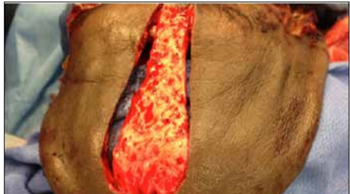
Figure 3: Intraoperative picture of flap preparation.