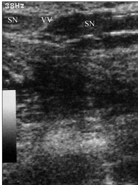
Figure 5: Ultrasonographic photograph demonstrated the injured site and sciatic nerve (Arrow shows the injured site, SN: Sciatic nerve).

of the schwann sheath, and degenerative and regenerative findings should be monitored using imaging techniques for peripheral nerves.