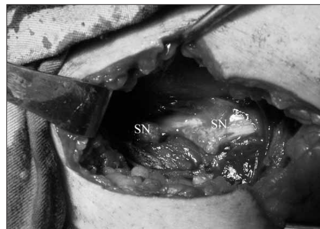
Figure 4: This figure shows the operative findings (SN: Sciatic nerve)