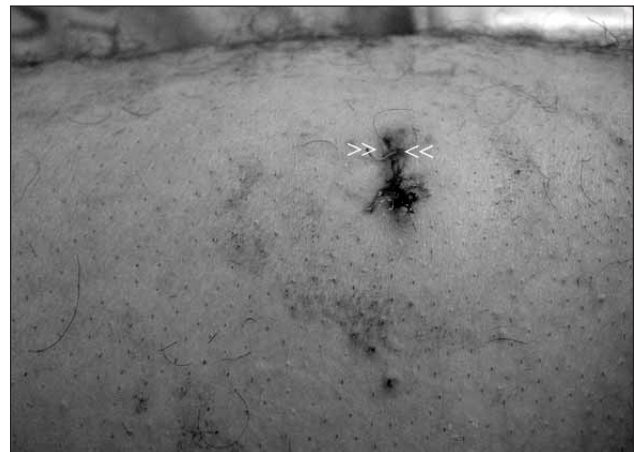
Figure 3: This case is an example of a retained knife. In this figure, the skin surface had the mark of a retained knife (Arrows shows the retained knife).