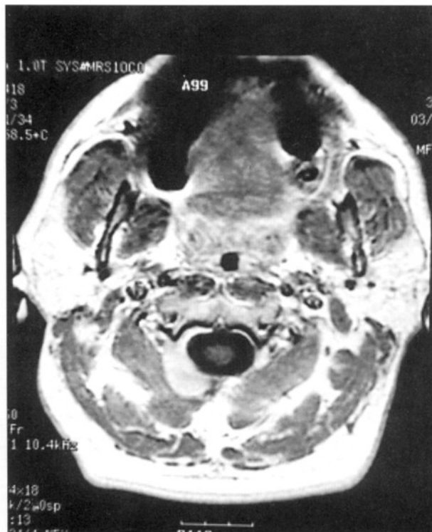
Figure 3: Contrast-enhanced axial T1-weighted MRI at 3 months after surgery at C5-6 and C6-7 demonstrates enlargement of the C2 mass.

operative MRI showed postoperative changes and no residual mass at the C2 operation site (Figure 5).