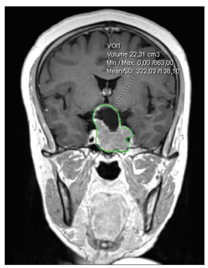
Figure 2: T1W-contrast enhanced coronal magnetic resonance imaging of a patient who was excluded from the study. The tumor was classifed as Knosp stage 3 when evaluated with the Syngo. via program.

Studies examining the distribution of patients affected by VFDs reported that approximately one-third of the patients presented with a typical bitemporal hemianopia (14,21,24). In our study, this proportion was 56.1% (n=64). As our aim was to analyze patients with VFDs based on volumetric measurements before and after surgery, we excluded patients with NFPAs in Knosp stages 3 and 4, which do not play a role in the development of VFDs but have a significant residual volume postsurgery (Figure 2). We considered only macroadenomas exhibiting suprasellar extensions. Other studies that investigated the visual outcomes of patients with NFPAs did not incorporate volumetric evaluations (11,15,21,24,28).