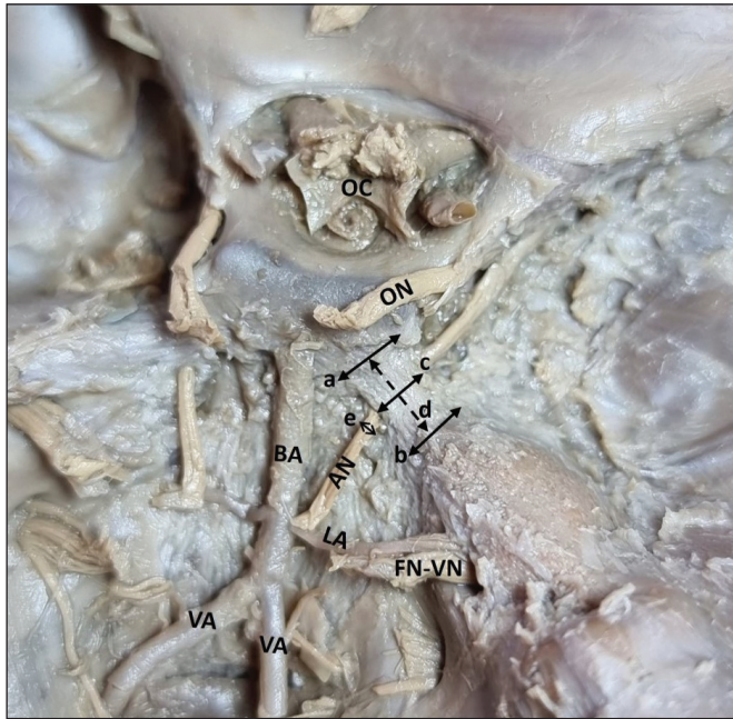
Figure 1: Morphometric measurements of PSL and AN. Width of the PSL at the clivus or PCP (a), width of the PSL at the petrous apex (b), width of the narrowest section of the PSL (c), length of the PSL (d), diameter of the AN (e), AN: abducens nerve, BA: basilar artery, FN: facial nerve, LA: labyrinthine artery, OC: optic chiasm, ON: oculomotor nerve, VA: vertebral artery, VN: vestibulocochlear nerve.

In this study, 10 newborn cadavers fixed with 10% formalin were used. A total of 20 PSLs and ANs from the 10 cadavers, on both the left and right sides, were examined. Clinical research ethics committee permission was obtained to conduct the study. To examine the PSL and AN structures, the following protocols were applied to each newborn cadaver.