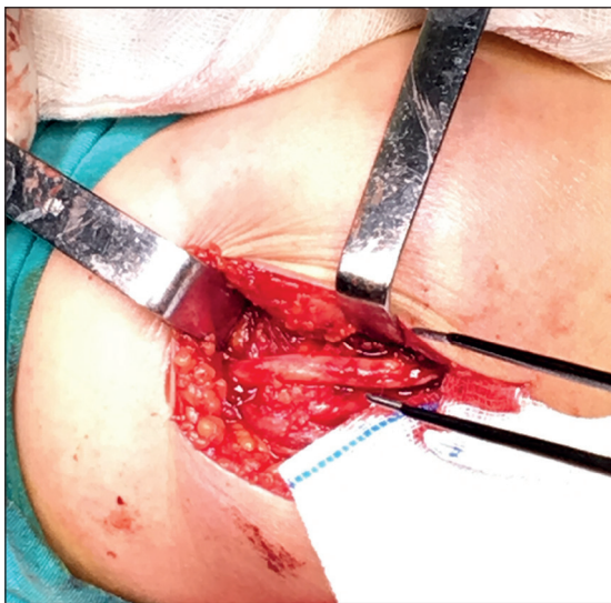
Figure 3: Anterior subcutaneous ulnar nerve transposition after simple decompression.

performed. With this technique, the nerve remains in its normal position and is protected from repeated compression. The average follow-up period was 107.5 months postoperatively, and no recurrence or nerve dislocation was detected. In cases wherein simple decompression is considered, the evaluation of the cubital tunnel via 3D CT and reshaping it if necessary may increase the surgical success.