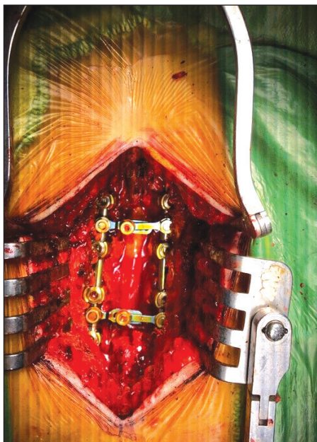
Figure 2: Perioperative image reveals the surgical field irrigated with rifampicin after the instrumentation.

analyzed by a chi-square test. Chi-square distribution tables were formed to facilitate these analyses. In these tables, a Pearson chi-square test was used for the cases, where the rate between the cell number with an expected value less than 5 and the entire cell number was below 20%. Where the rate was above 20%, Fisher's exact chi-square test for four-eyed research design was used. A Monte Carlo chi-square test for the research designs with more than four eyes was also used. The possible value of p < 0.05 was considered as significant.