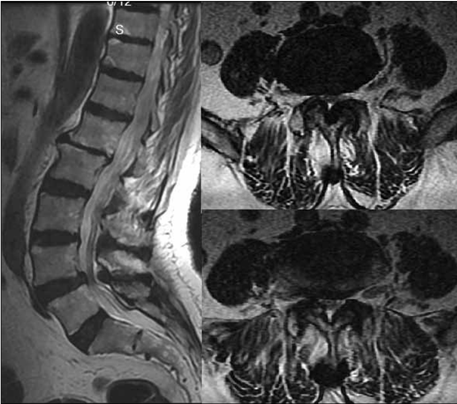
Figure 1: Pre-operative T2-weighted sagittal and axial MRI shows grade 1 spondylolisthesis with severe stenosis.