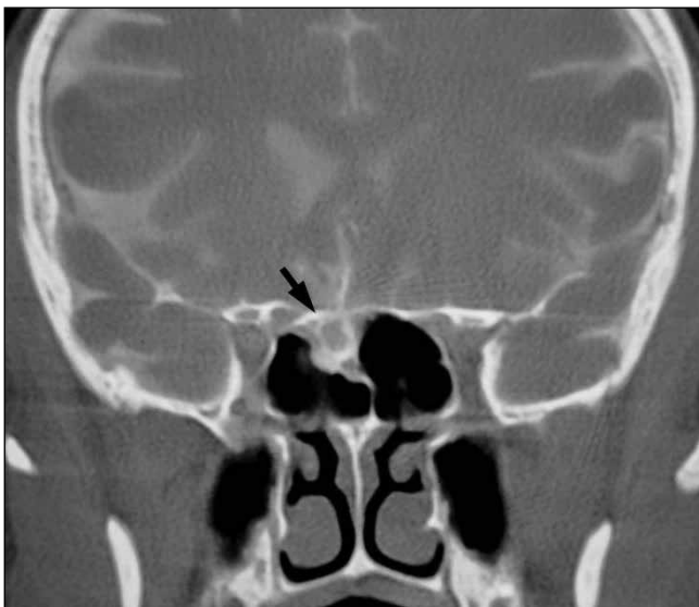
Figure 2: CT cisternography of the patient showing a sphenoid sinus roof defect and herniated pseudomeningocele beneath (arrow).

predisposes to potentially life-threatening consequences and sudden cerebral death occurs frequently by the involvement of the brain stem (9,24). After a non-lethal craniocerebral GW, various collateral damages could happen in the neighboring structures. One of them is skull base injury, which could cause CSFr (9).