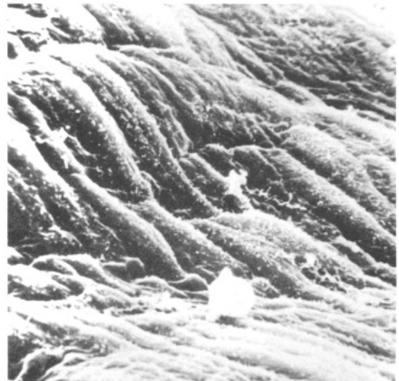
Fig.3 : Scanning electron micrograph of the graft luminal surface at three weeks. X450.