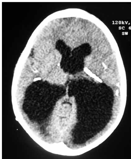
Figure 2: CT scan shows enlarged occipital horns of the lateral ventricles and calcifications in the brain.