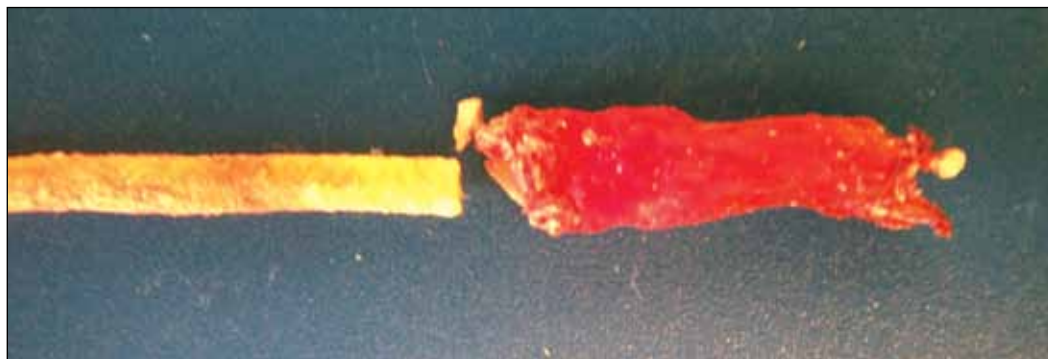
Figure 3: Macroscopic view of the calcified shunt tube and fibrocalcified tissue.