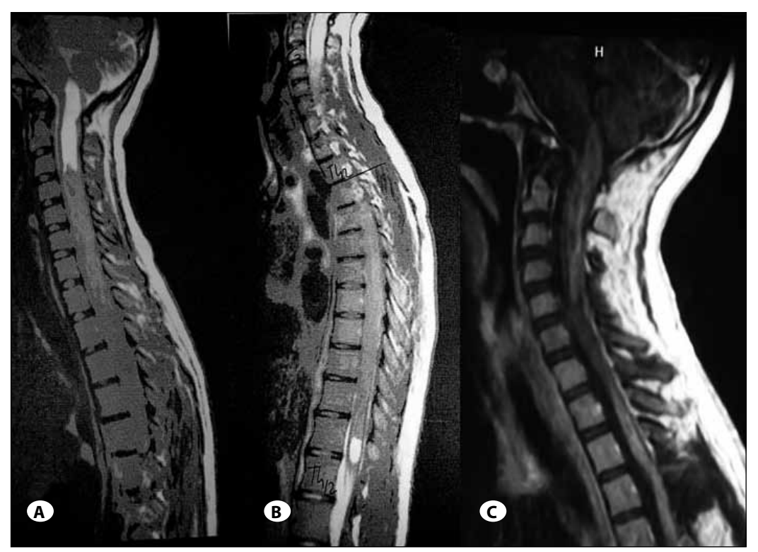
Figure 1: Preoperative MRI: Sagittal T2W of cervicothoracal (A, B) , and gadolinium enhanced sagittal T1W cervicothoracal (C) spine images showed a heteregenously solid tumor extending from the cervicomedullary junction to the conus medullaris.