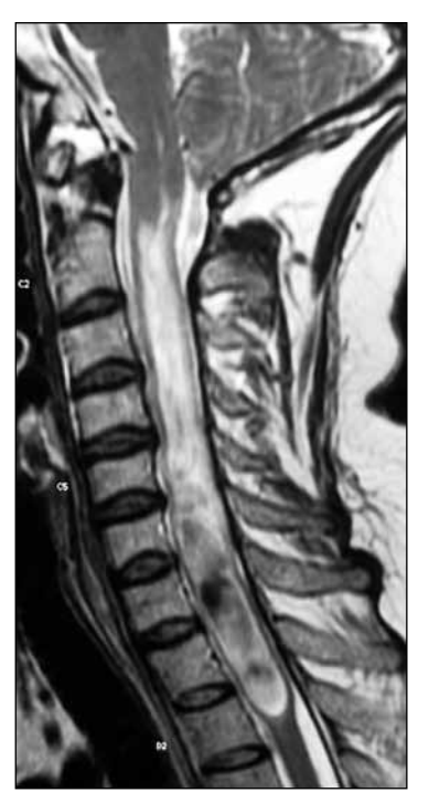
Figure 1: Magnetic resonance imaging of cervical spine sagittal section showing cerebellar tonsillar herniation below foramen magnum with large syrinx extending from C2 to D2 level.

A 34-year-old female was referred to our institute with progressively increasing dysesthesia in both upper extremities and imbalance on walking since four years. Neurological examination revealed, dissociate sensory loss on upper limbs with increased tone in lower limbs. Power was grade 5/5 in all four limbs. Magnetic resonance imaging of the spine was obtained which revealed cerebellar tonsillar herniation below foramen magnum with large syrinx extending from C2 to D2 level (Figure 1). The patient underwent foramen magnum decompression and syringosubarachnoid shunting with