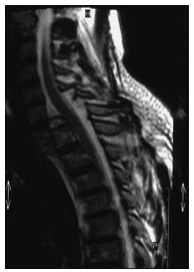
Figure 1: MRI revealed total spondyloptosis at C7-T1 level with the body of the C7 vertebra lying almost totally in front of the T1 vertebra without compression of the spinal cord.

Traumatic spondylolisthesis of the cervical spine following high-speed motor vehicle accident and diving injuries is relatively common (10), but it is unusual for traumatic spondyloptosis in this region not to be associated with a myelopathy (15).