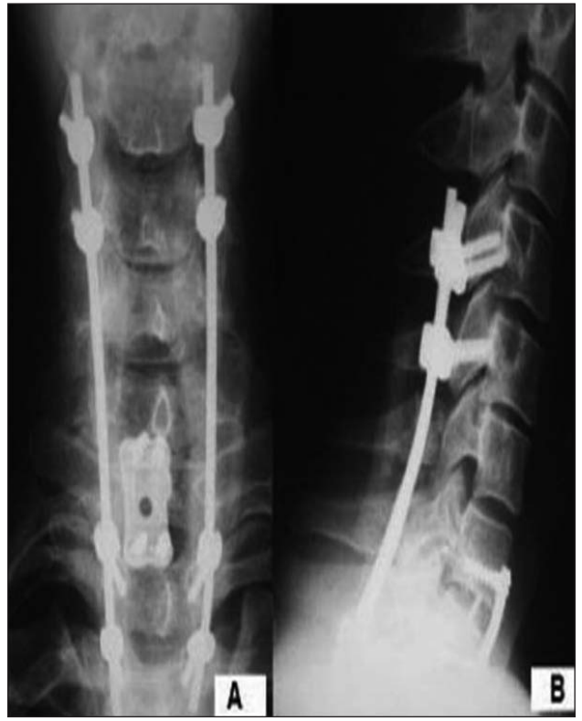
Figure 3: Lateral and anterior-posterior X-rays showed the excellent realignment achieved by C4-C5 lateral mass and T2-T3.

Menku and his colleagues were the first to report such a case of (C6-C7 post-traumatic spondyloptosis without neurological deficits) (13). Our case is the first spondyloptosis of the cervicothoracic junction (C7-T1) without a neurological deficit.