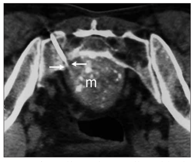
Figure 2: Fifty-year-old man with an expansible mass (m) in the anterior of the sacral 1st vertebra. Left posterolateral approach was performed with a 14G Tru-cut needle passing through an 11G bone needle (arrows) (diagnosis: insufficient material as necrosis).

All biopsies were performed by two staff radiologists (the first and second authors) in turn. After a small skin incision and insertion of the biopsy needle, CT was obtained to check the right approach. The needle was then advanced to the calculated depth. Periosteum and cortex were passed with a rotating motion of the needle. The needle stylet was withdrawn if CT documented the needle tip within the lesion. In case of any soft tissue component, a 14G Tru-cut needle was advanced through this needle coaxially. If not, the 11G needle cannula was advanced with a single torque motion to obtain biopsy material. Control CT was taken following the biopsy. After the biopsy, we applied pressure with a sponge for 10 minutes against hemorrhage.