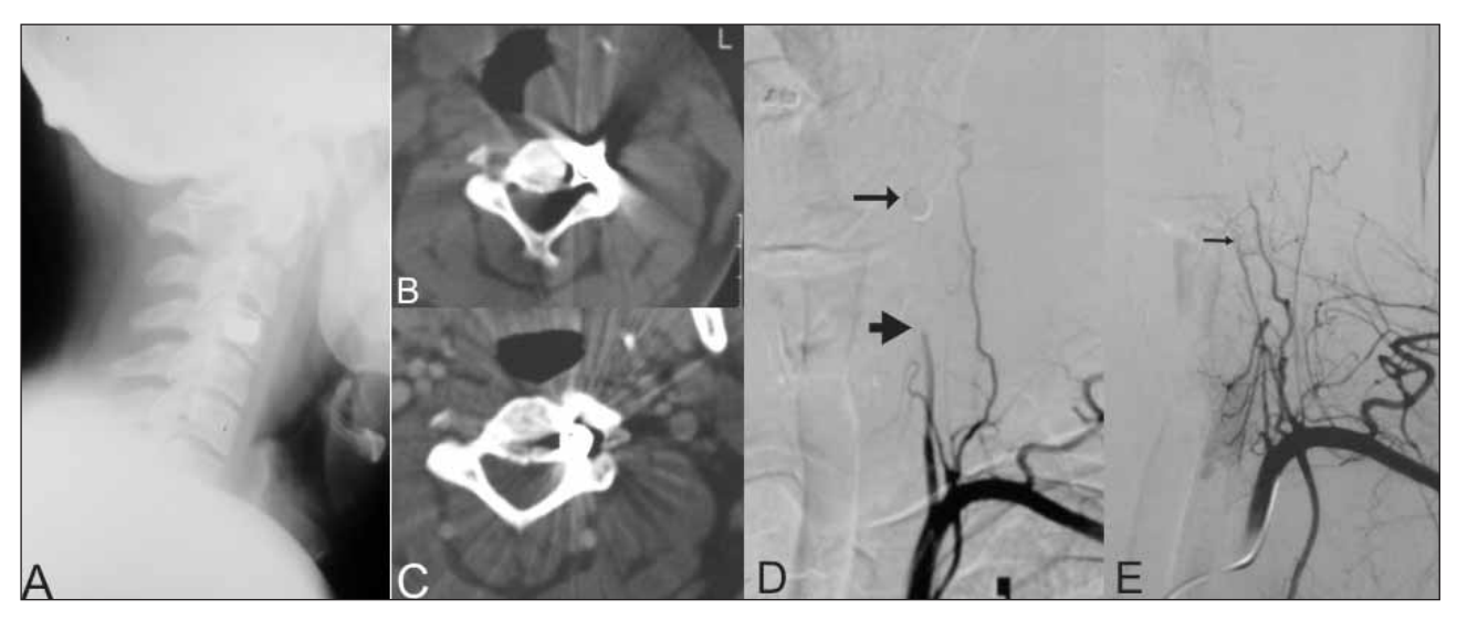
Figure 1: A. Lateral cervical X-ray revealed the bullet at the level of fourth cervical vertebra (C4), B . Axial CT of cervical spine at the level of C4 demonstrated a mass effect on the trachea due to a soft tissue fragment and metallic piece to the left transverse process, C . Same axial CT section after two years of follow-up showed decompression of trachea, D . Four-vessel DSA at the time of diagnosis did not detect any flow on the left VA (thick arrow) a few segments proximal to the bullet (thin arrow), E . There was still no flow distally of the vertebral artery (arrow) after two years.

A 20-year-old man was subjected to a gunshot injury. He was neurologically intact and physical examination was normal apart from the entry zone of the pellet on the neck. His systemic condition was stable and there were no signs of hypovolemic shock. The pellet was localized at the transverse process of C6 on direct X-rays (Figure 2A,B). Cranial CT scan was normal and the cervical spinal CT scan revealed slight bony damage to the left side of the C6 transverse process (Figure 2C). Control and followup Doppler ultrasound (DUS) measurements of flow for bilateral vertebral and carotid arteries were