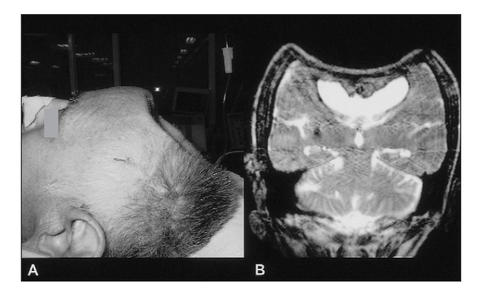
Figure 2: The patient's neurological status again deteriorated again just before his discharge following sudden sinking of the skin flap ( A ). A coronal T2-weighted MRI scan demonstrated extensive compression of the skin flap onto the fronto-parietal cortex ( B ).

duraplasty. The patient's neurological status gradually improved. One month later, the patient's neurological status again deteriorated following sudden sinking of the skin flap (Figure 2A). At that time, the patient had flexor response but no localizing pain. The MRI scan demonstrated extensive compression of the skin flap onto the brain (Figure 2B). No change was observed in the position of the skin flap and the neurological status of the patient during the next 48 hours. It was decided to keep the patient in the Trendelenburg position two hours of every four hours. The flap returned to its normal position (Figure 3A) in two days and the patient's neurological status improved. The MRI scan revealed normal position of the flap, with the brain filling the intracranial cavity (Figure 3B).