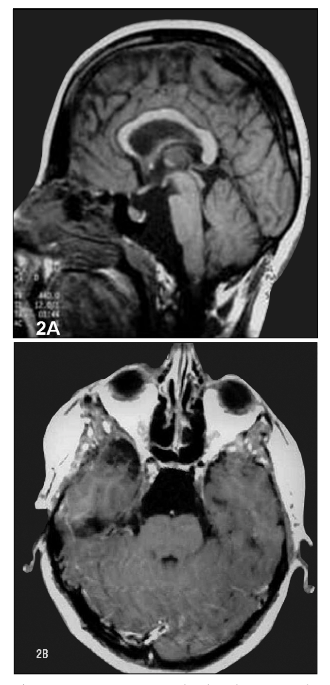
Figure 2: A: MR images, sagittal and axial view. B : Early postsurgical T (inf/1/weighted) image after intravenous infusion of gadolinium-DTPA demonstrating no evidence of residual tumor mass.

inferior end of the lateral wall and from the roof of the orbit for about 3 cm posteriorly was carried out separately. The basal squamous temporal bone and the superficial part of the sphenoid ridge were rongeured away. Further resection of the sphenoid