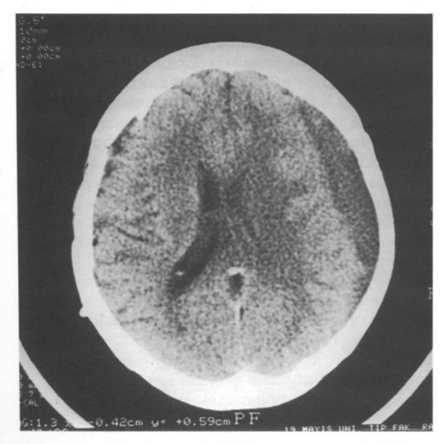
Figure 2. Cranial CT performed 1 month postsurgery confirms that the initial collection where the shunt was placed has completely resolved, but reveals a second CSH in the frontotemporal region on the contralateral side.

closed drainage, drain placement, membrane resection, and subdural-peritoneal shunt placement (1,5,7). None of these procedures has proven to be superior to the others, and patient status and the surgeon's preference usually determine the management choices.