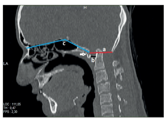
Figure 2: (a) Basilar invagination [extension of the dens axis to the superior of the McRae line], (b) atlantoaxial subluxation [atlantodental interval (the distance between the C1 anterior arch and the dens axis) of >5 mm], (c) platybasia [abnormal flattening of the skull base at an angle >143°] and (arrow) occipitalisation of the atlas [the appearance of a transitional vertebra formed from the union of the atlas and occipitus]

peak of the dorsum sella and the line drawn along the edge of the clivus arch) (18), and the Wackenheim clivus angle (the angle between the line drawn from the peak of the dorsum sella to the basion and the line extending from the basion to the posterior surface of the C2-3 vertebrae) (15) (Figures 3, 4).