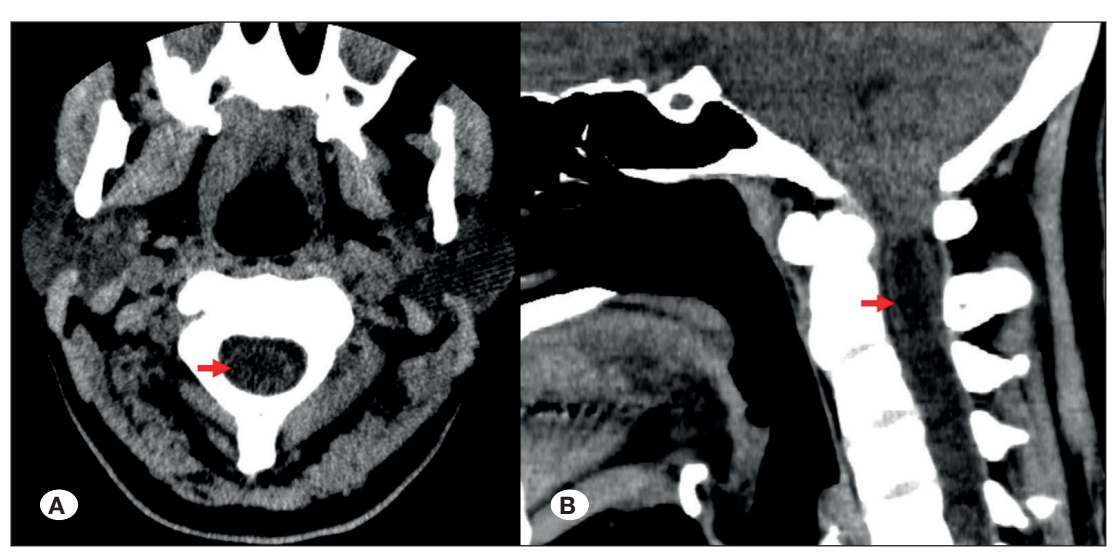
Figure 5: Syringomyelia on axial (A) and sagittal (B) CT images of the cervical spinal cord.

The mean length of the supraocciput line was shorter in the TE group than in the control group, but the difference was not statistically significant (p=0.17). The mean length of the supraocciput line was statistically significantly shorter in the CM1 group than in the control group (p=0.03) (Table II). No statistically significant difference was determined between the CVJA (+) and CVJA (-) CM1 groups in respect of the mean length of the supraocciput line (p=0.171).