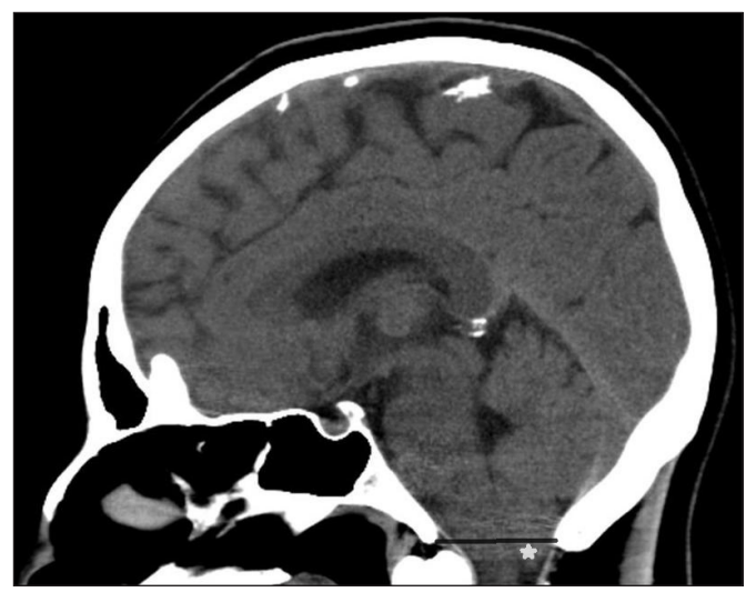
Figure 1: Chiari malformation Type 1 [tonsillar herniation extending inferiorally from the foramen magnum! (*).