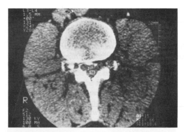
Fig. 3: Post myelographic CT revealed a soft tissue mass.

space. Intrathecal metrizamid myelopraphic CT revealed a soft tissue mass which was pressing and displacing the dural sac anteriorly (Fig. 3).