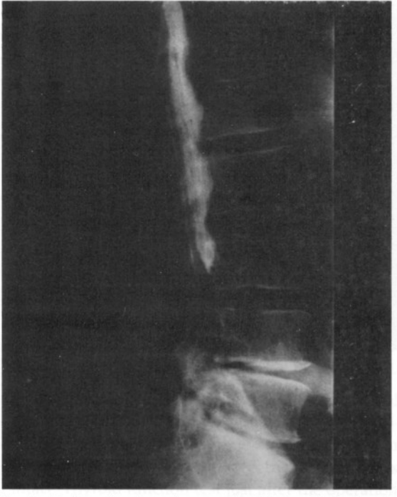
Fig. 2: Myelography showed a complete block at L3 level and narrowing of L4-5, L5-S1 intervertebral space.