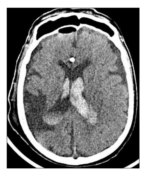
Figure 1: Nonenhanced CT demonstrates intraventricular hemorrhage and mild ventricular dilatation. There is also an old right posterior cortical watershed infarct.

We presented a case of intraventricular hemorrhage associated