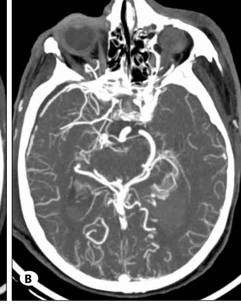
Figure 3A, B: CT angiography, axial maximum intensity projection (MIP) images. Bilateral intracranial segments of the internal carotid arteries, middle and anterior cerebral arteries and its branches are significantly slimmer in appearance. Posterior circulation is prominent. There are extensive dilated collateral vessels in both cerebral hemispheres.