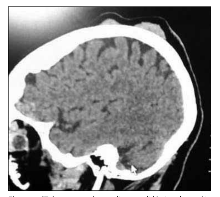
Figure 2: CT demonstrated two adjacent solid lesions located in the subgaleal region.