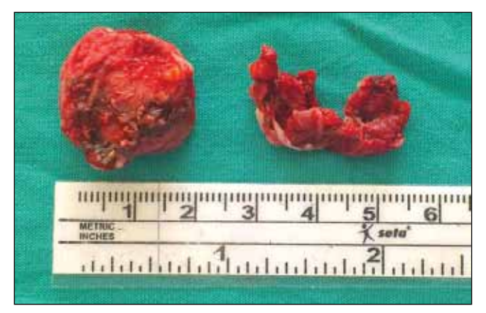
Figure 3: The larger solid lesion was 2.5 \times 2 \times 1,5 cm in size.

prone to recur. BCA of the parotid gland should be classified as a low-grade carcinoma due to their biologic behavior. The prognosis of this tumor could not have been established statistically because of the rarity. The local recurrence rate varies between 28% and 76% (6). Metastases have occurred in less than 10% of patients (1). Due to the rarity of distant metastasis and regional lymph node involvement, long-term outcomes following surgery are favourable (1, 3).