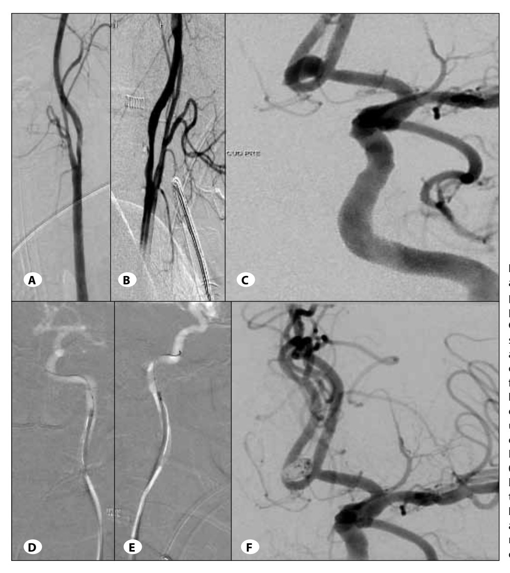
Figure 1: A, B) Cerebral angiogram showing left proximal ICA ulcerated plaque causing 50% stenosis. C) Angiographic projection showing lobulated ACOM aneurysm along with an outpouching from the fundus of the aneurysm. D,E) 5 French guiding catheter navigated across the ulcerared plague over the completely deflated Maveric PTCA balloon catheter over 0.014" microguidewire under biplane roadmap guidance to the upper cervical ICA. F ) postembolization angiogram showing near complete aneurysm obliteration.

Figure 2: Cerebral Hemodynamic evaluation using "syngo iFlow". A) syngo iFlow colour-coded image of the angiogram obtained with guiding catheter placed proximal to the carotid stenosis and B) colour-coded image of the angiogram obtained with guiding catheter distal to the stenosis. Similar colour sheds in all of the intracranial vessels in these images suggest no significant change in cerebral blood flow after crossing the stenosis with guiding catheter. Note that the vein of Labbe in both the images shows the same blue color.