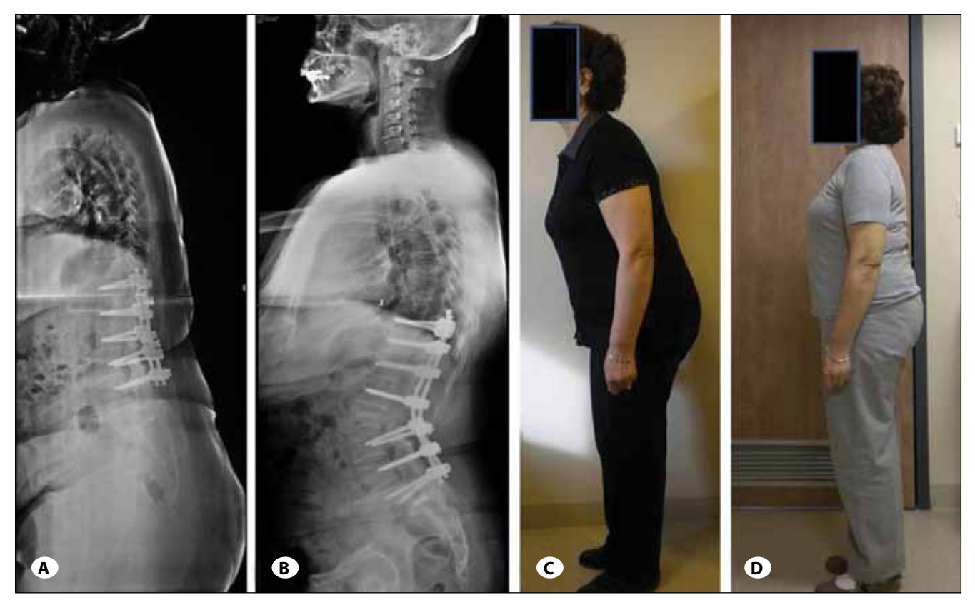
Figure 4: A 59-year-old female patient had undergone two operations related to degenerative spinal stenosis, but a year after these surgeries, the patient experienced progressive back pain and a leaning forward posture (flat back syndrome). The patient submitted to an operation for the flat back syndrome. An L2 pedicle subtraction osteotomy and a T10-L5 posterior instrumentation were performed to restore the sagittal balance. A) Pre-operative lateral x-ray showing lumbar region flat back syndrome; distortion in the sagittal balance is observed. B) Post-operative lateral x-ray showing a restored sagittal balance after L2 pedicle subtraction osteotomy and T10-L5 posterior instrumentation. A plumb line from the C7 corpus is shown vertically passing the sacrum. C) Pre-operative flat back syndrome and the related posture distortion, observed in a lateral x-ray. D) Post-operative correction of patient posture and restored sagittal balance, as observed in a lateral x-ray.