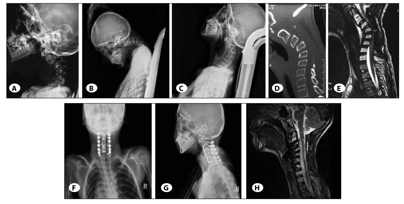
Figure 1: An 11-year-old male patient had a C1-C6 intradural intramedullary malignant tumor, and a C1-C6 laminectomy and gross total tumor resection were performed. Post-operative radiotherapy was administered due to a glioblastoma multiforme pathological result. After the 6th month follow up after the laminectomy, kyphosis was noted in the patient, and a re-operation was performed to treat the kyphotic deformity. At the patient's follow-up at the sixth post-operative month, he had neck pain and demonstrated a regression in his neurological status (tetra paresis). No correction of the deformity was evident in the pre-op x-rays, and fusion was observed at the level of the lower cervical laminectomy. Thus, anterior releasing, posterior osteotomy, instrumentation and fusion, anterior fusion and instrumentation were planned surgically. First, an anterior approach was used for the C2-C3, C3-C4, C4-C5 and C5-6 discectomies to achieve the anterior release (preserving the posterior longitudinal ligament). Next, the position was switched for a posterior approach, from which the lower cervical segments were fused. Polysegmental Smith-Peterson osteotomies were performed with C2 pars screws, C3-6 lateral mass screws and C7 pedicle screws, which were applied to restore the sagittal balance and posterior stabilization. Fusion was also performed. Then, the patient's position was again altered for an anterior approach, and a peek cage filled with osteografts was inserted. Fusion was performed at the C2-C7 region using anterior plaques. The patient underwent this procedure as a 540-degree surgery. No complications arose peri-operatively, and the patient's neurological status recovered rapidly. At the post-operative 6 month follow-up, fusion was observed. A) Pre-operative (deformity surgery) lateral x-ray. B) Pre-operative hyperflexion x-ray. C) Pre-operative hyperextension x-ray. D) Pre-operative sagittal CT image. F) Post-operative 6th month AP x-ray. G) Post-operative 6th month lateral x-ray. H) Post-operative 6th month MRI.

The correction of kyphotic deformities with surgery was first described by Smith–Peterson in 1945 (53). An osteotomy to resect the posterior units, thus undercutting the adjacent spinous processes, was proposed, after which the osteotomy would be closed posteriorly. Thus, the extension osteotomy