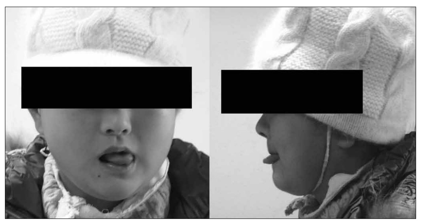
Figure 1: Limited movement and protrusion of the tongue outside the mouth.

Video EEG monitoring (10-20 System) demonstrated sharp waves in bi-temporal regions as well as independent left or