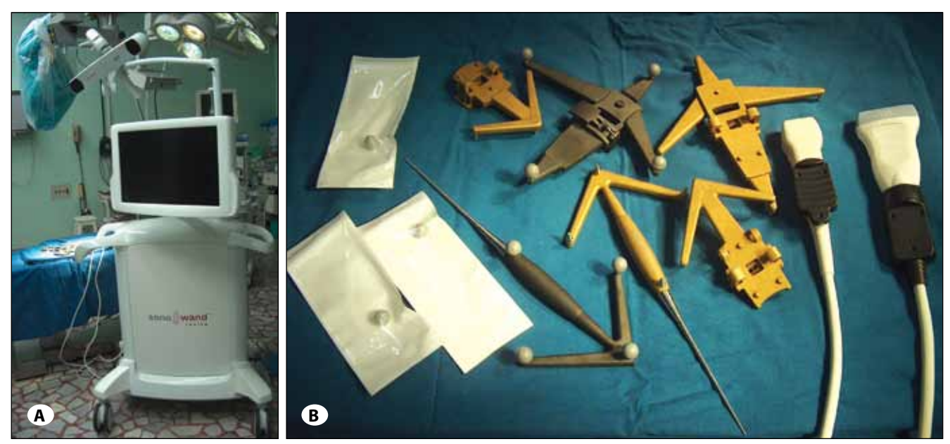
Figure 1: (A) Ultrasound based neuronavigation system SonoWand Invite<sup>™</sup> (Mison, Trondheim, Norway). (B) Ultrasound transducers 10 and 12 Mhz together with reference stars and calibrated referent probes compatible with neuronavigation system SonoWand Invite<sup>™</sup>.

A series of 100 to 200 2D ultrasound images were produced by the applied system, which via software reconstruction were processed into a 3D reconstructed image. The process of software reconstruction took approximately 1 minute, thus enabling the performance of a new series of fast, repeated registrations, for example, after partial removal of the tumour or a shift of the target within the surgical site. After the acquisition of a 3D image, the ultrasound transducer was removed from the surgical site.