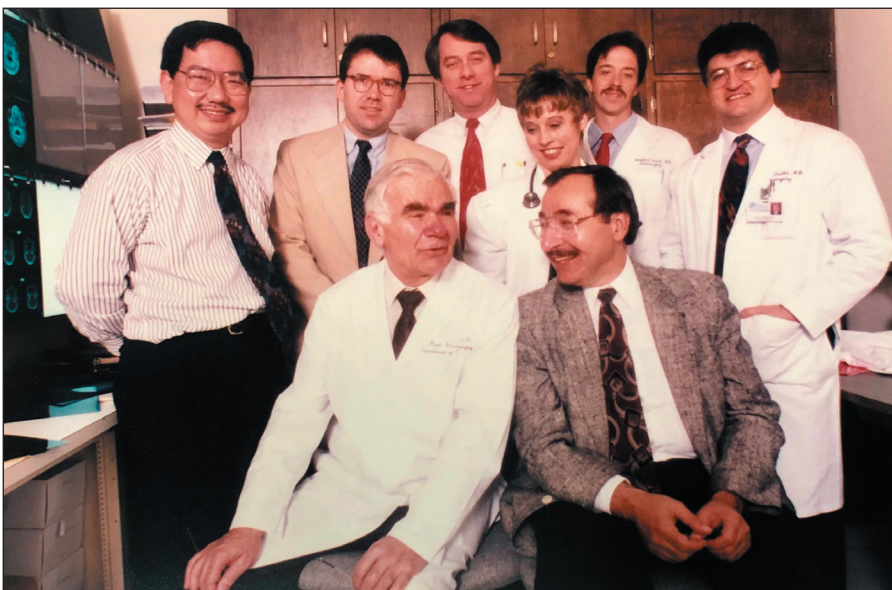
Figure 7: Professor Yaşargil in a conference at his early time in the department of neurosurgery at University of Arkansas Medical Sciences beaming with happiness, joking with dr Al-Mefty.

It could be all summed up by the dedication of the Operative Atlas of Meningiomas to Professor Yaşargil: “To Professor M. Gazi Yaşargil – his brilliant mind changed the world of neurosurgery, his gifted hands changed the world of so many patients, and his caring heart changed my world.” (3).