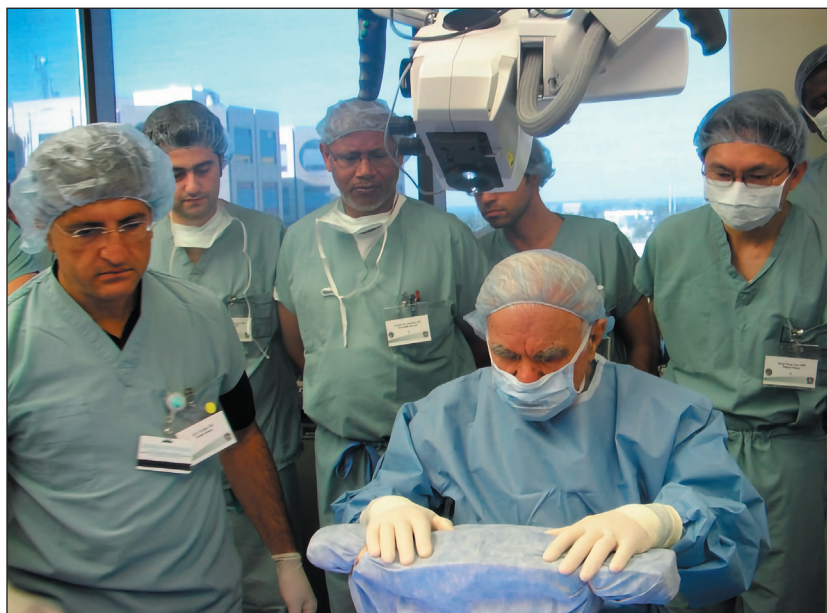
Figure 5: Lab demonstration was his prime push to every neurosurgeon and enthusiastically lead the demonstrations on every occasion.