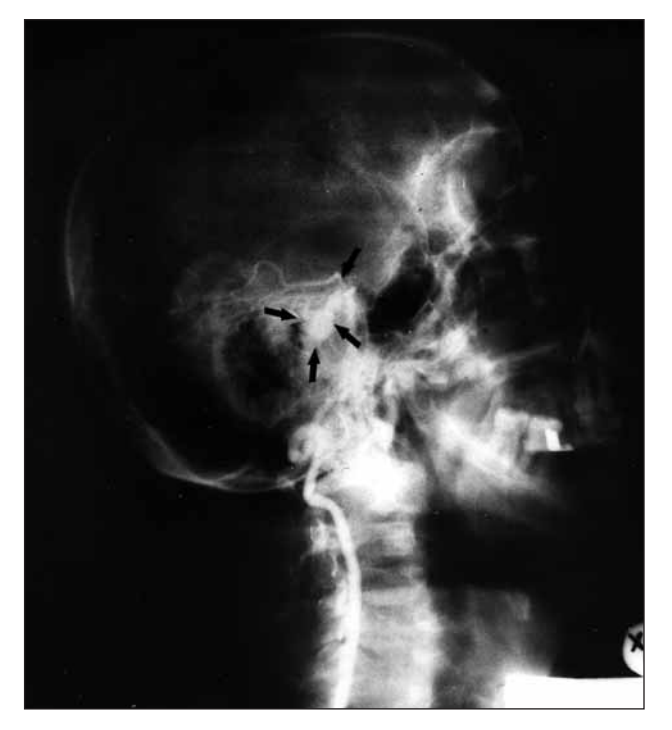
Figure 2: Conventionally performed selective right lateral vertebral angiogram showing irregular shaped large SCA aneurysm (lower arrows). The upper arrow indicates the right posterior cerebral artery. Note that the distal SCA could only be vaguely defined due to vasospasm.

existence of organized thrombus formation and an atherosclerotic plaque inside the neck. Two temporary clips were applied for 9 minutes proximally and distally to the neck and the fundus of the aneurysm was opened. Once the thrombus formation and plaques were removed completely, a permanent aneurysm clip was applied to the neck with no difficulty (Figure 3 B and C). Blood flow in