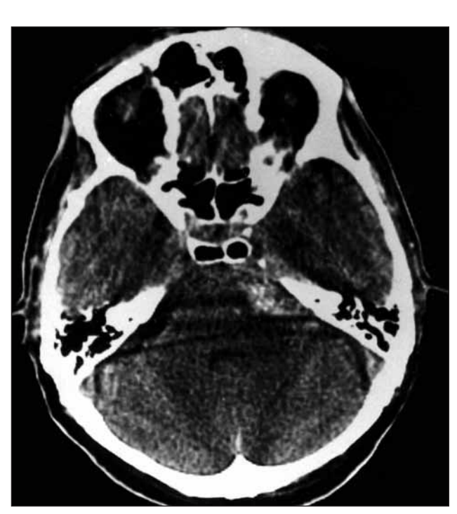
Figure 1: Figure 1. Cranial CT of the patient obtained on admission revealing a right PCA hemorrhage (Fisher grade 3).

A 44-year-old man was admitted to the hospital after losing his consciousness. Before admission, he had suffered from headache, nausea, and vomiting for 2 weeks. On neurological examination right third and fourth cranial nerve palsies, and left hemiparesis were found besides the unconsciousness. Nuchal rigidity was positive. His vital functions were all normal. Cranial computed tomography (CT) showed a right Fisher grade 3 cerebellopontine angle (CPA) hemorrhage (Figure 1). His medical history obtained from a local hospital revealed that he had had 2 additional subarachnoid hemorrhage attacks without neurological deficit within the last three years and that he had refused further investigations. The patient's clinical presentation was classified as WFNS 4 subarachnoid hemorrhage (SAH) score. No angiography was planned for the patient as a digital angiography system was not accessible in the hospital in that patient became conscious time. The and neurologically normal in two weeks with conservative treatment. The patient could not be transferred to an advanced radiology department because of social security reasons and a conventional angiography through the femoral artery route was performed on the 25th day of SAH. Angiograms of the anterior cerebral circulation and