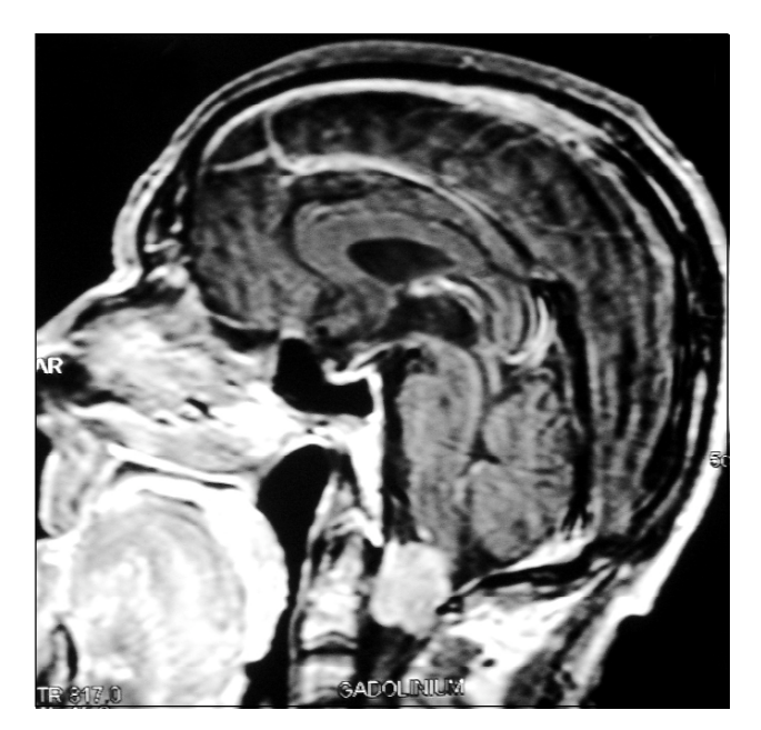
Figure 1: Preoperative T1 sagittal magnetic resonance imaging with gadolinium enhancement showing an intradural mass lesion enhancing homogenously in the region of foramen magnum.

Medelec Synergy Electromyography was used to obtain evoked potentials. Tibial SEP responses were elicited by stimulation of the tibial nerve posterior to the medial malleolus, using square-wave electrical pulses (duration 0.1 ms, 20 mA intensity). Stimulation intensity was sufficient to elicit a toe twitch. For recording, active electrode was placed as Cz with a reference electrode at Fz according to the international 10-20 system. A ground electrode was placed over tibialis anterior muscle. The time base was set to 100 ms and a filter band pass of 10Hz to 2kHz was used. 500 trials were averaged. SEP monitoring was applied during baseline and continuously throughout the procedure (Figure 2). The recordings were visually analyzed for the presence of the main peaks P40-N50, peak to peak amplitudes, peak latencies and compared to baseline recordings.