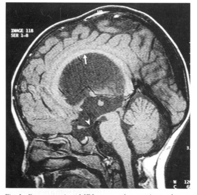
Fig. I: Preoperative MRI scan of a patient shows downward bulging of the third ventricular floor and the appropriate point for Fenestration at the floor (arrowhead). Notice the bowing of the thinned corpus callosum (arrow).

The goal of ETV is to provide free flow of cerebrospinal fluid (CSF) between the ventricular system and the basal cisterns. This is done by fenestrating the floor of the third ventricle between the mamillary bodies and the infundibular recess (Figure 1). When this is done, the CSF in the ventricular system circulates through the prepontine cistern, reaches the cortical subarachnoid space, and is absorbed by the arachnoid villi. Compared the shunt placement, ETV offers a more natural physiological solution to hydrocephalus. It is associated with lower complication