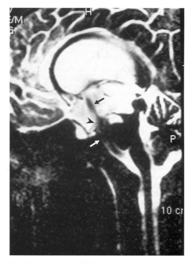
Fig. IV: Postoperative MRI scan of a patient shows the fenestration site (arrow head) and flow void in third ventricle and prepontine space (arrows).

Fig. III: Early postoperative Cine PC MR image of a patient shows continuous caudal flow through ventriculostomi site between the third ventricle and prepontine space which implies a patent fenestration (arrows). Notice the presence of caudal flow in cervical subarachnoid space as well and absence of any flow void in the aqueduct of Sylvii.