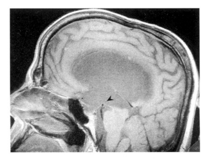
Fig. II: MRI scan of an older hydrocephalic patient shows anteriorly and upwardly displaced basilar artery (arrowhead). Notice the tenting effect of basilary tip on the third ventricular floor.

observations of flapping of the edges of the fenestration site during the procedure implies patency of the ventriculostomy and free CSF flow, this sign alone not very reliable. Findings indicating clinical improvement are considered more valuable for assessing the success or failure of ETV. Clinical findings such as resolution of papilledema, normalization of ICP, relaxation of the fontanelles, and stable head circumference indicate a successful procedure.