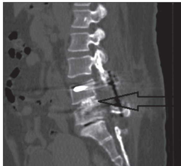
Figure 4: Computed tomography image of a patient in group A obtained at postoperative 5 years. The black arrow indicates the interbody fusion (grade 4; diffuse and continuous bone formation).

Moreover, both groups did not significantly differ in terms of intervertebral disc height protection (Table V). In group A, three