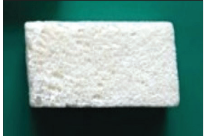
Figure 2: A synthetic solid calcium hydroxyapatite blockgraft.

And according to the MIC values there were no linear or non linear relationships were found between paired variables.