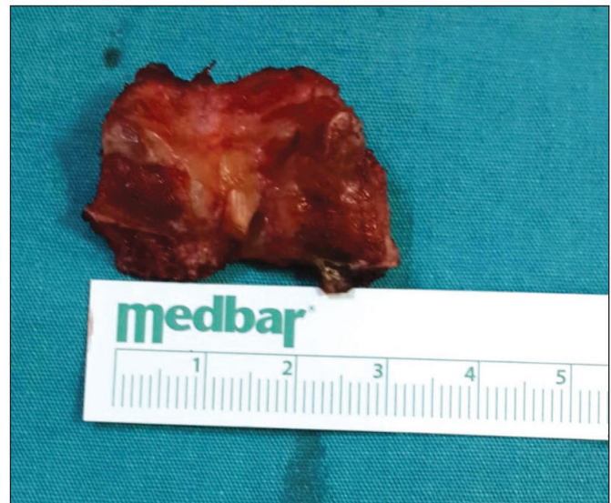
Figure 1: An autograft obtained from the spinous process during total decompression.