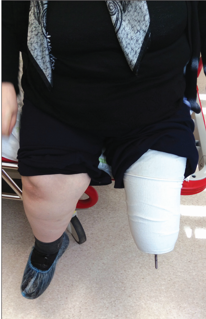
Figure 1: The patient's amputated left leg under knee.

the level of the previous phantom pain, and the pain in the hip disappeared totally. The sciatica of the patient was therefore resolved.