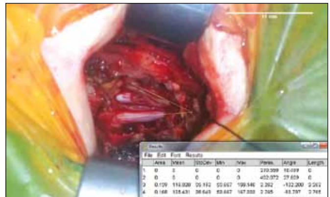
Figure 2: Roots angle and thickness measurements with ImageJ program from the operation records.

Nerve root thickness was measured using the ImageJ program. Accordingly, the mean nerve root thickness was 1.92\text{ mm}\pm 0.45\text{ mm} for medially located roots and 3.33\text{ mm}\pm 0.95\text{ mm}