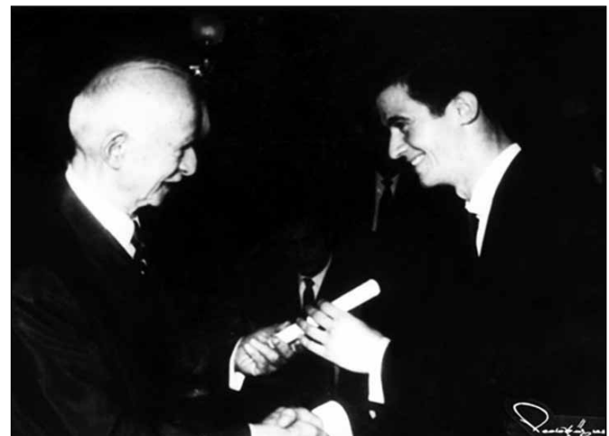
In memory of Yücel Kanpolat