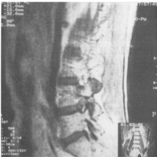
Fig. 1 : Sagittal image. The nerve root superior to the herniated disc is seen at L4-5 level.