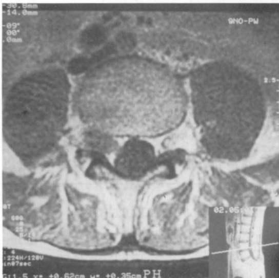
Fig. 2 : Axial image. A fragmentary disc hernia is seen on the right at L4-5 level.

30 degrees) images. In each case, T1-weighted images were obtained in the sagittal and axial planes, and fast images in the sagittal plane. The location of the herniated disc was defined in relation to the facet joints and the vertebral body on the axial images, and to the nerve root within the foramen on the sagittal images. An intravenous infusion of gadolinium diethylenetriamine pentaacetic acid (Gd-DTPA) (Schering, F.R.G.) was performed in 5 cases. 3 of which were operated for disc herniation before