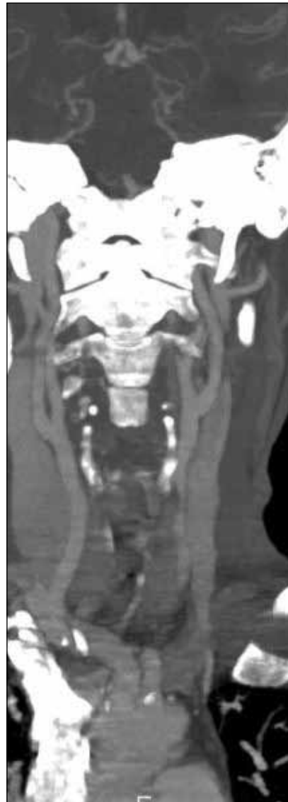
Figure 1: Cerebral tomography angiography of the supraaortic trunks. The internal carotid arteries are permeable, with normal diameters.

Antiplatelet therapy with acetylsalicylic acid 100 mg was started. Cranial MRI did not show any acute ischemic lesions.