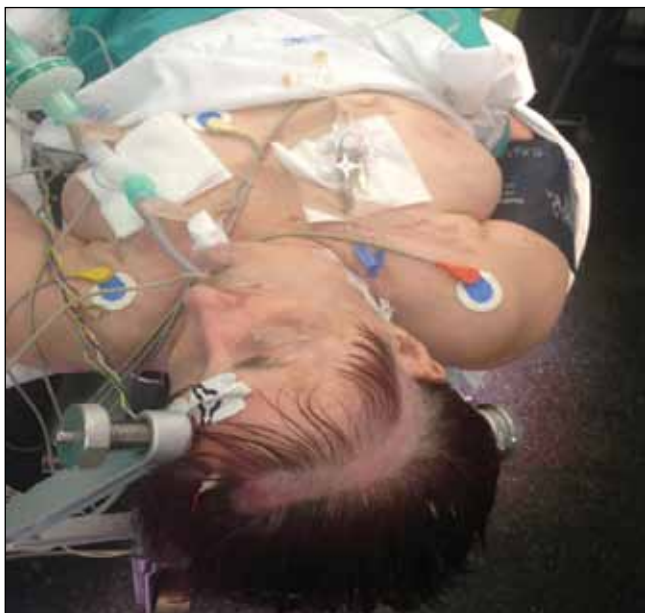
Figure 2: Head position during the 5-hour surgery. The head is rotated 30 degrees to the left.

This is the first case reported in the literature of carotid dissection due to a common surgical position. The patient had no relevant risk factors, such as fibromuscular dysplasia, that predispose to carotid dissection. The 30 degrees rotation of the head used in this case is the standard access to MCA aneurysms. There is a clear temporal association between the anisocoria and the surgery. Therefore, we can say that carotid