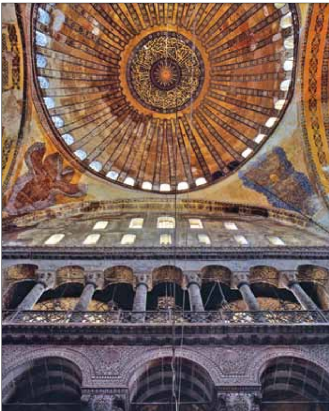
Figure 4: Another view of the central dome and upper gallery.

Naos, Hagia Sophia's worship area, is divided into two side naves by four large pillars and the columns between them (Figure 4, 5). This section that longitudinally clearly represents the Byzantium basilica plan has dimensions of 73.50 x 69.50 meters. The main section is on pendants carried by four large pillars and the dome that sits on the hoop is 55.60 meters