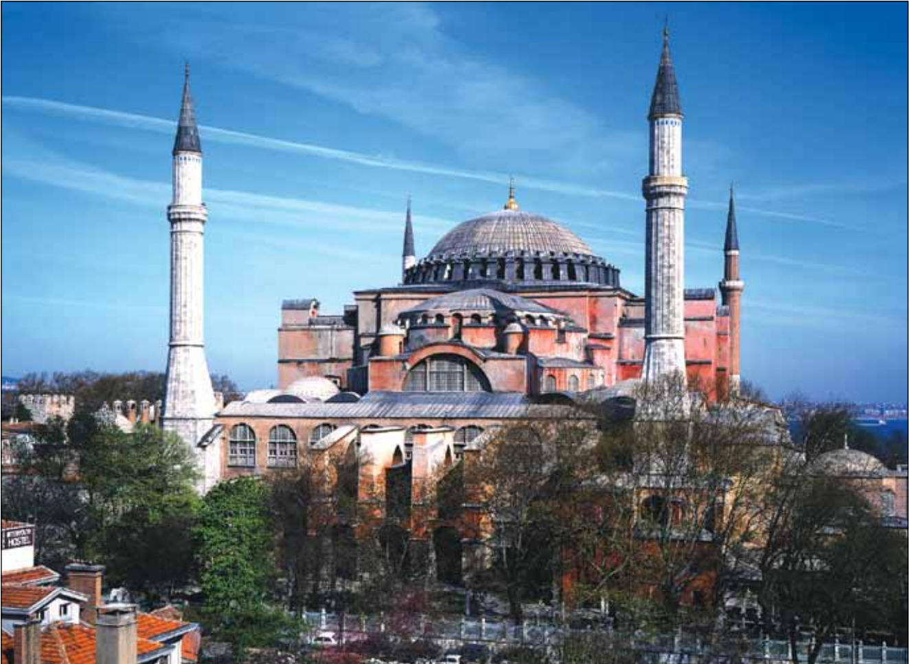
Figure 1: General view of Hagia Sophia.

reported that Hagia Sophia's construction started during the Emperor Constantinius I era (324-337) and finished in 360 during the Emperor Constantinius II era. The famous historian Socrate states that the structure's first name was Megalo Ecclesia ( meaning a colossal church ) and it was named Hagia Sophia (Holy Wisdom) after the 5th century. This name is not related to any saint and is one of the three names of God according to the main principles of Christianity. Hagia Sophia