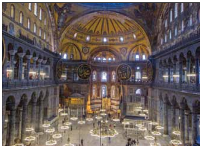
Figure 3: Interior view of Hagia Sophia.

was therefore dedicated to Theia Sophia ( the Holy Wisdom ), the second of the Christian triad. It was started to be called Megalo Ecclesia as well (Figure 1, 2).