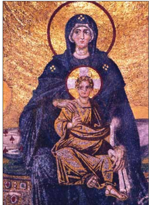
Figure 11: The Virgin Mary in the semi-dome of the apse. 9th century.