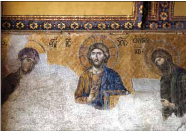
Figure 9: The Deesis trinity (Christ, Mary and John the Baptist) in the gallery. 12th century.