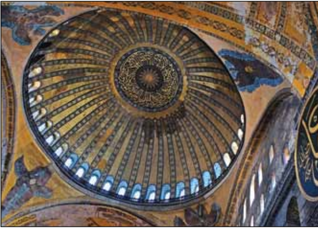
Figure 6: Central dome of Hagia Sophia.