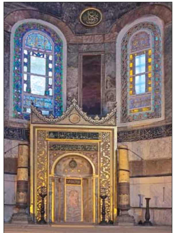
Figure 12: Mihrab of Hagia Sophia. Ottoman period.

Hagia Sophia was transferred to the museum management after a protocol that was arranged between the İstanbul Deputy Governor, Director of Pious Foundations and the İstanbul Museums General Director. An intensive project was started to make sure the Hagia Sophia Museum could be opened to the public within a short time, and the museum started accepting visitors on 1 February 1935. The Hagia Sophia monument has been standing for more than 1500 years and has been the world's biggest closed area for 800 years. It has been subject to several earthquakes with the main dome being rebuilt several times and the supporting structure being repaired and reinforced during several periods. It is possible to see the effects of previous earthquakes and large deformations in the structure at present. Hagia Sophia has been able to survive until now, thanks to restorations during the Byzantine, Ottoman and Republican era.