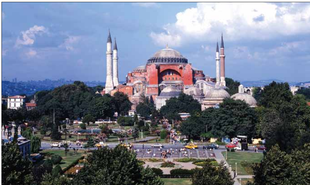
Figure 2: General view of Hagia Sophia.