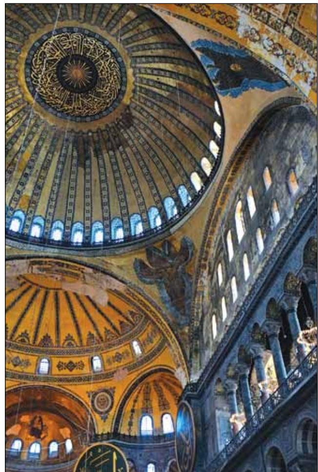
Figure 5: Another view of the central dome and the South tympanon wall.

Hagia Sophia is known for its mosaics in addition to its architecture (Figure 8). All surfaces, arches, vaults, half-domes and overlays of Hagia Sophia other than the marble-covered walls are embellished with lovely mosaics (Figure 9). The first