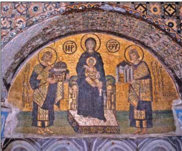
Figure 10: The Virgin with the emperors Constantine and Justinian over the door way of the South vestibule. 10th century.

Secretary of State Şükrü Kaya, Secretary of Education Abidin Özmen, Secretary of Finance Celal Bayar and other ministers.