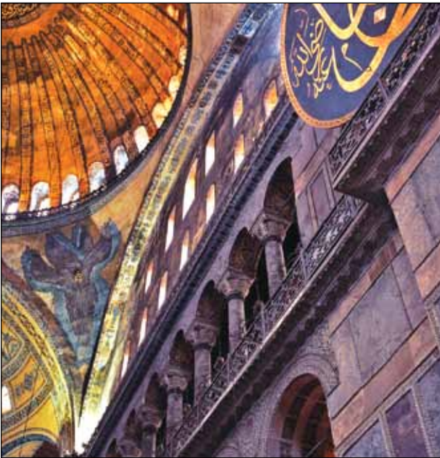
Figure 7: The series of columns on the South tympanon wall above.

mosaic figures of Hagia Sophia were destroyed during the figure breakage movement in Byzantine history and gilded mosaics with plant figures replaced them. The monument has become more magnificent with the mosaic figures created after the Iconoclasm movement. These mosaic figures have been created in the IX and XIIth centuries and can be seen on the Emperor's Door, the southern entry (Vestibule) (Figure 10), abse half-dome (Figure 11), northern Tympanon walls, the southern gallery and the northern gallery. The Christ Pantocrator composition in the dome has been left below the Kazasker Mustafa İzzet Efendi line created in the Ottoman period. Lower quality mosaics are also present in the area called priest rooms in the upper gallery.