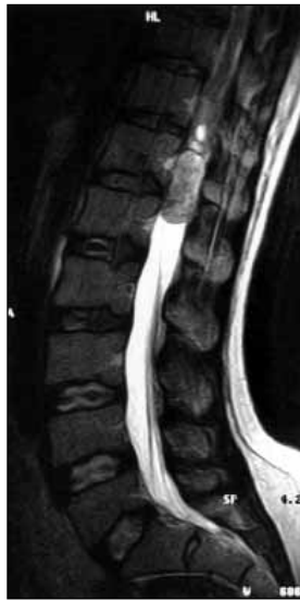
Figure 2: Sagittal T2-weighted magnetic resonance image revealing the cauda equina fibers separated by the lesion.