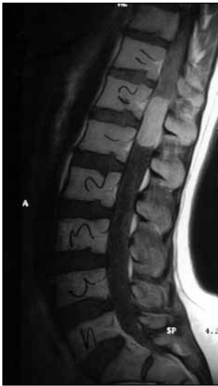
Figure 1: Sagittal T1-weighted magnetic resonance image with contrast revealing the lesion at conus medullaris level.