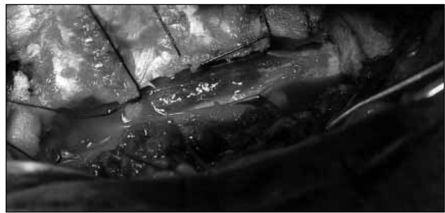
Figure 3: Intraoperative view of the tumour after dura was opened.